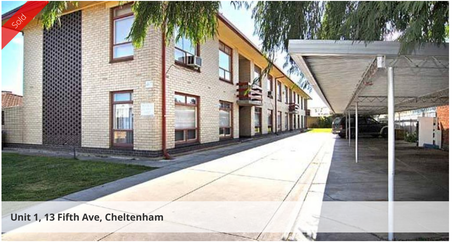
Unit 1, 13 Fifth Ave, Cheltenham